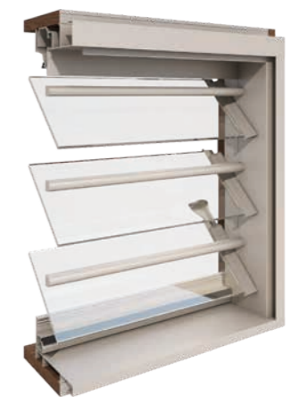
The Easyscreen Window System with (optional) integrated D bar security system. Suits 152mm louvres only.